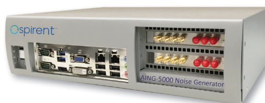
AING-5000 Automotive Impairment Noise Generator

Spirent AING-5000 will allow developers to create continuous background noise, electro mechanical switching impulsive events, and RFI noise – noise conditions/types that are problematic. Testing these real world conditions has become a necessity, but a very costly and time consuming endeavor if a physical EMC chamber is the only verification tool available. Automotive Ethernet ECU developers can now optimize the features in this noise generator tool to create unlimited testing scenarios to identify the impact noise conditions have on Automotive Ethernet ECU transmission.